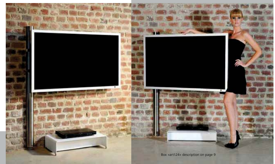
Box »art124« description on page 9