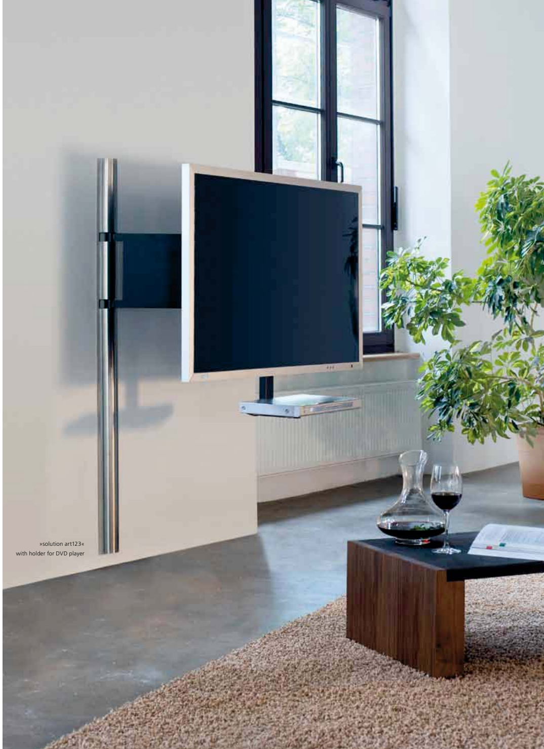
»solution art123« with holder for DVD player