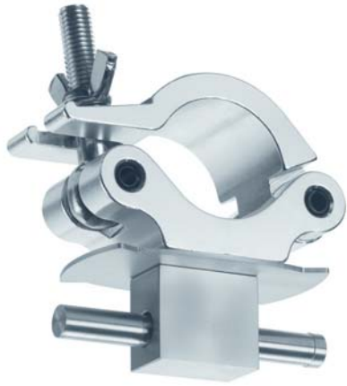
Truss adapter PUC 1090