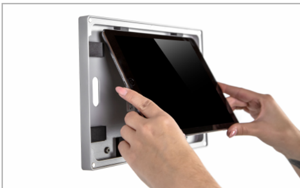
Fig. 4 inserting the tablet