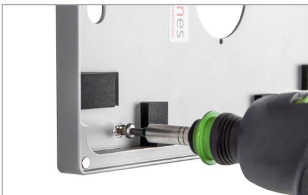
Fig. 3 screwing the housing