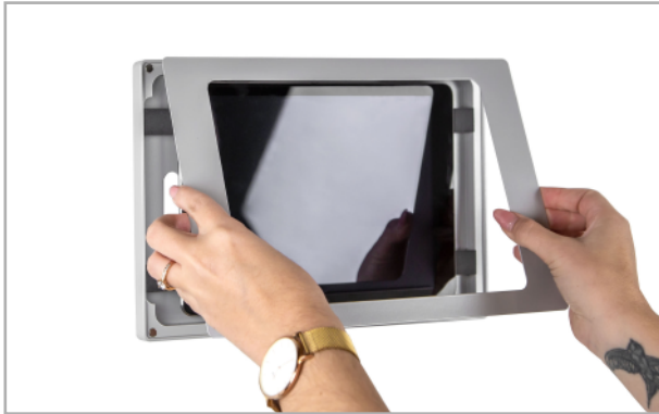
Fig. 5 attaching the magnetic frame