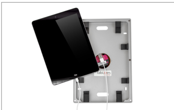
Fig. 7 optional power supply

If you wish to install your TWH directly above a power socket, the charging cable can be led out through the opening which is provided in the housing. In this case, spacers must be fitted between the wall and the housing. Spacers are included in the scope of delivery by prior arrangement.