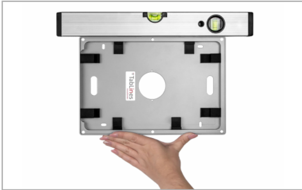
Fig. 1 adjusting the housing