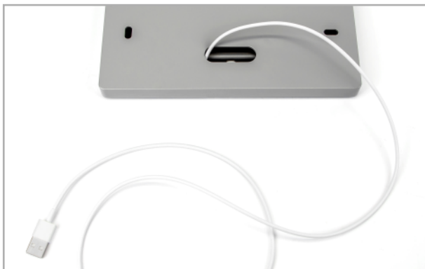
Fig. 6 optional cable routing