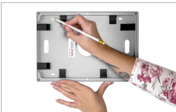
Fig. 2 marking the holes for drilling