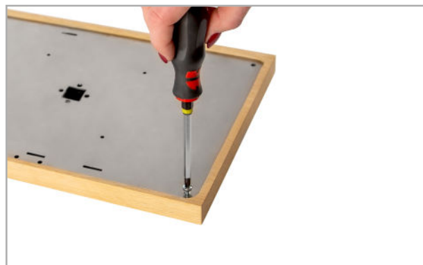
Fig. 2: Loosen the screws on the housing