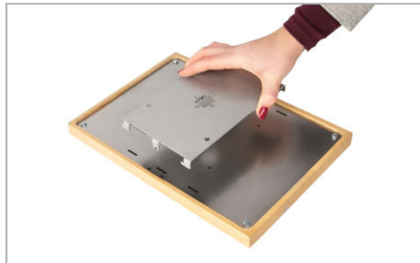
Fig. 1: Removing the mounting plate