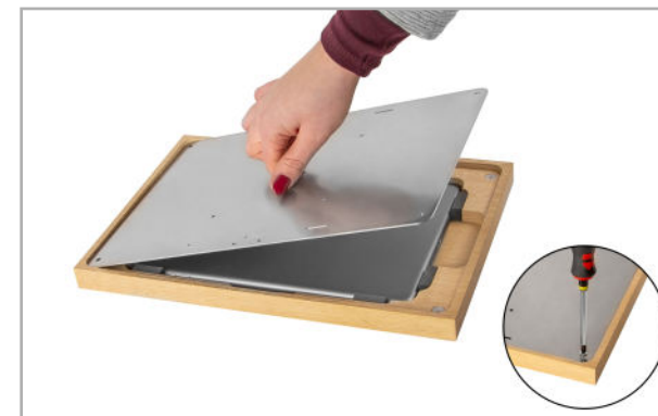
Fig. 5: Close housing