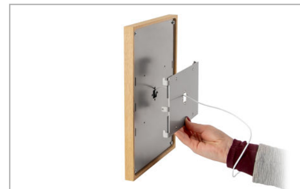
Fig. 6: Attach the fastening plate