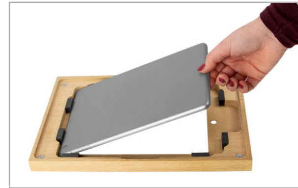
Fig. 4: Inserting the tablet