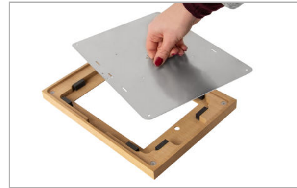
Fig. 3: Remove the housing from the frame

Attention: The screws are needed again in step 2.5 to fix the enclosure..