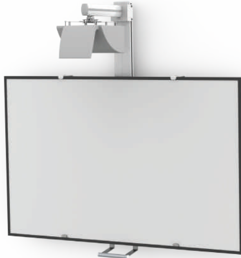
Board and projector are not included.