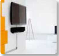
Hide the cables. SMS Cable Management.

Accessories: SMS Cable Management (Page 6:01).