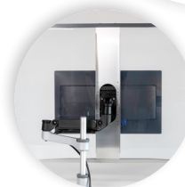
R-GO HYGIENIC SAFETY SCREEN