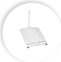
R-GO MORELIA DOCUMENT HOLDER