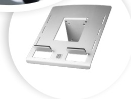
R-GO MORELIA LAPTOP HOLDER