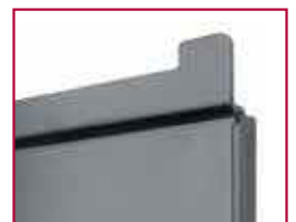
Specially designed safety tabs for secure support