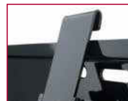
Easy hook-on design

* Designed exclusively for use with ultra-thin displays 2" (51mm) deep or less