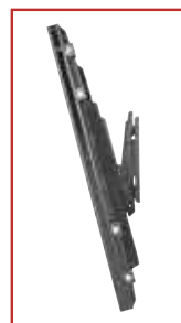
+15°/-5° of tilt for versatile viewing angles