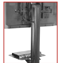
Cable management allows cables to enter or exit anywhere along the column