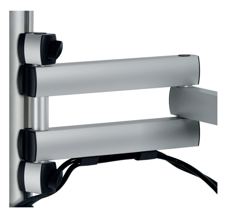
the cable holder in the folding arm ensures a safe and tidy cable management