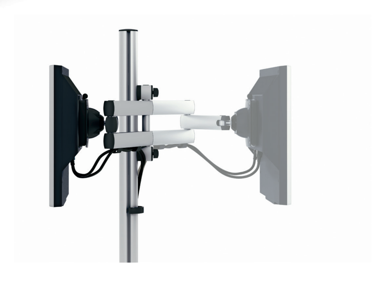
thanks to their multi-part articulated design, TSS folding arms can be turned horizontally through any distance to provide the best possible monitor viewing angle around the column. Depending on column attachment