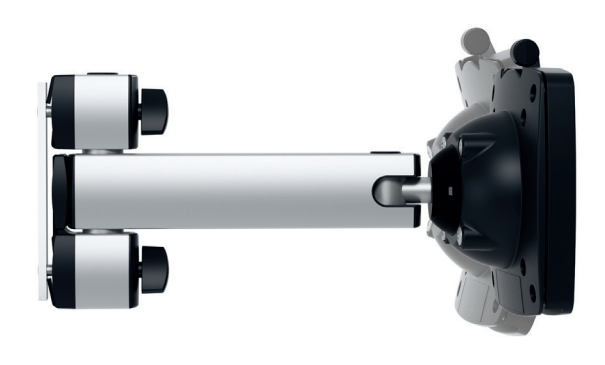
ball-joint for flexible and precise positioning of the monitor