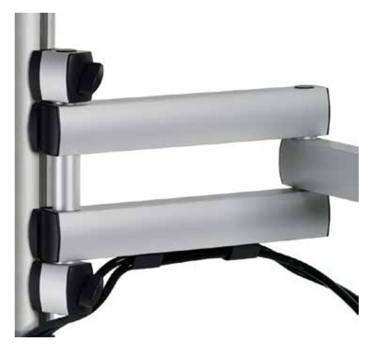
the cable holder in the folding arm ensures a safe and tidy cable management % \left( 1\right) =\left( 1\right) \left( 1\right)