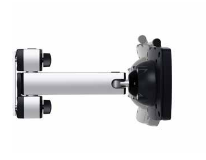
ball-joint for flexible and precise positioning of the monitor