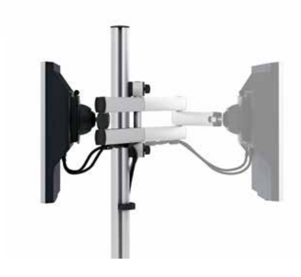
thanks to their multi-part articulated design, TSS folding arms can be turned horizontally through any distance to provide the best possible monitor viewing angle around the column. Depending on column attachment