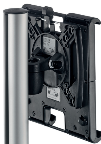
Rear view of NOVUS MY one + NOVUS MY tab