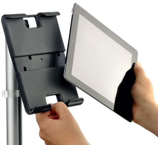
A tablet is easy to insert in landscape format.