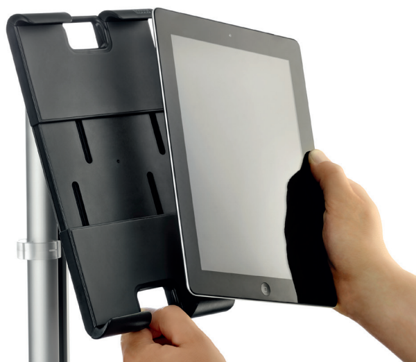
A tablet is easy to insert in portrait format.