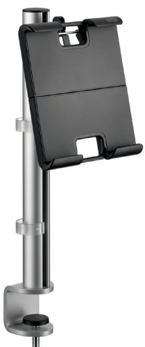
NOVUS MY one + NOVUS MY tab