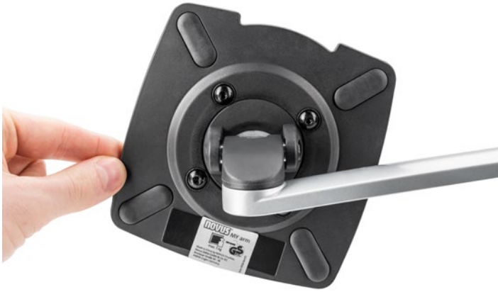
MY fix 2.0, black