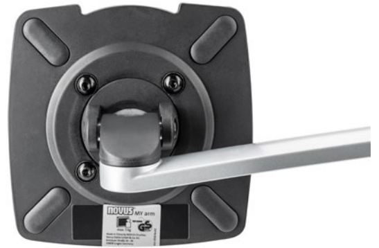
MY fix 2.0, black