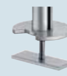
Grommet (5-70 mm)