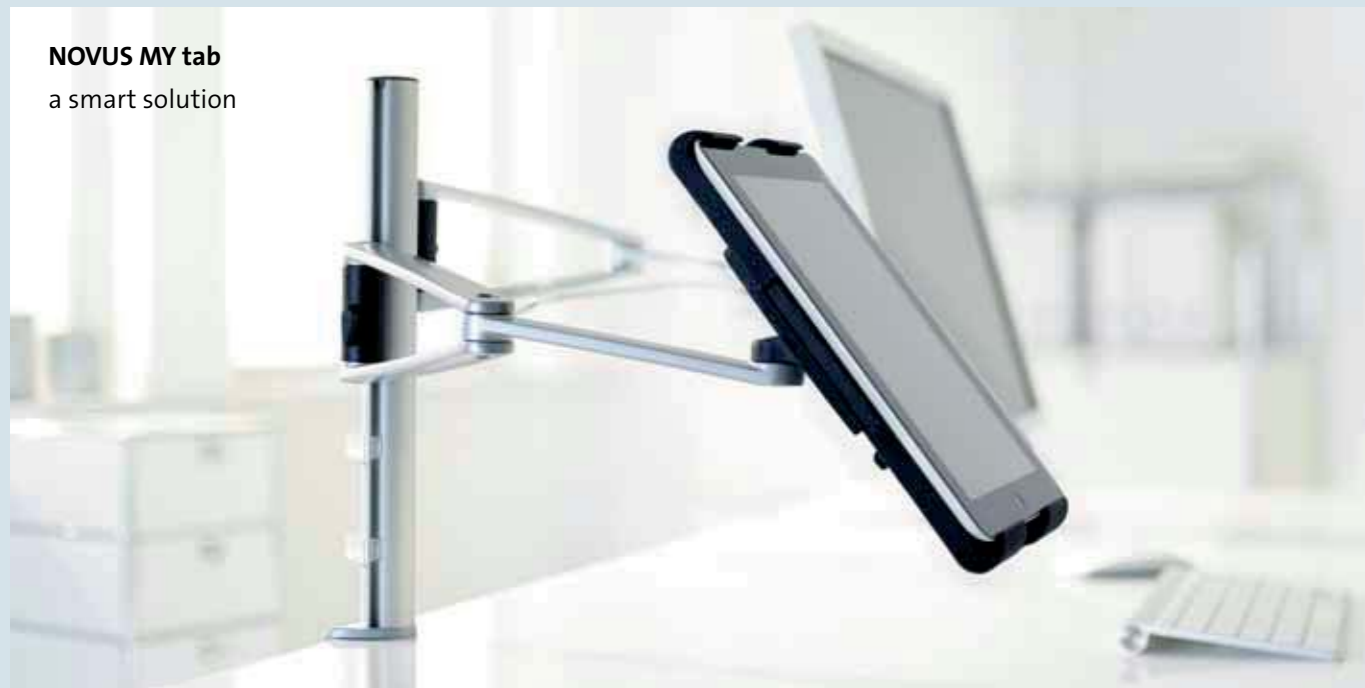
NOVUS MY tab a smart solution

Cable Clips for cable management along the column and support arm.