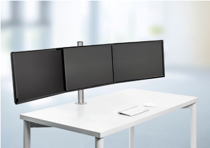
NOVUS TSS Trio monitor holder Trio telescope