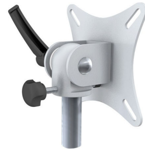
Grey RAL 7035