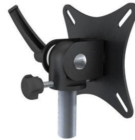
Black RAL 9011