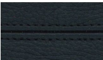
Corvara Midnight with Noir stitching