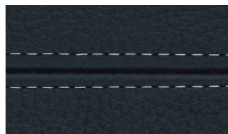
Corvara Midnight with Light Grey stitching

*Printed colors shown may not perfectly match actual leather or stitch colors. Please review a leather swatch or stitch sample before placing an order.