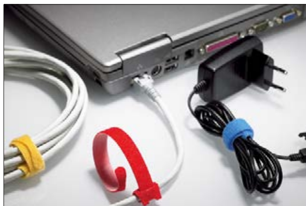
Due to the functional cable tie design the TEXTIE is fixed on the cable and can't get lost.