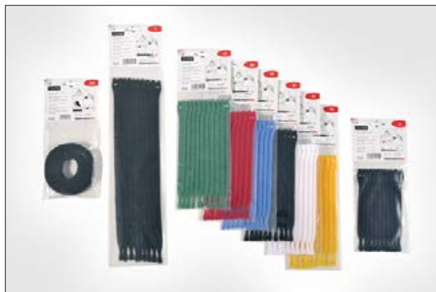
The TEXTIE-Series is available in different colours and lengths.