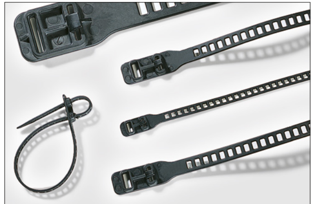
The elasticity of the SOFTFIX ties makes them suitable for use in many applications.

i With 2nd loop to run bundles in parallel!