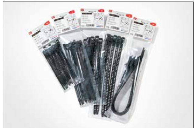
SOFTFIX ties available in small packaging units.