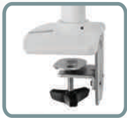
INCLUDED: STANDARD 2-PIECE DESK CLAMP ATTACHES TO SURFACE EDGE