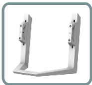
RECOMMENDED ACCESSORY: LX DUAL DIRECT HANDLE KIT 98-037-062