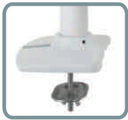
GROMMET MOUNT KIT ACCESSORY 98-034: ATTACHES THROUGH SURFACE HOLE