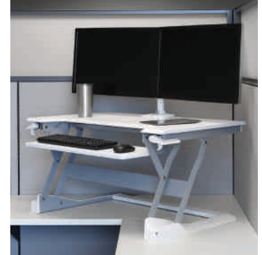
SHOWN WITH WORKFIT-TL SIT-STAND WORKSTATION

THE LOW-PROFILE MONITOR CROSS-BAR PROVIDES A COMPACT RANGE OF MOTION