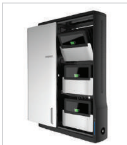
Zip12 Charging Wall Cabinet

Custom country-specific outlet strip includes plenty of space to work with oversized wall adapters and mini-bricks