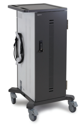
Compact design maneuvers easily through crowded hallways and into tight spaces with 4" (10 cm) dual-wheel rubber casters (2 directional-lock for easy steering, 2 total-lock to keep it in place) and a wide ergonomic handle