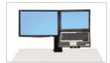
LCD & Laptop Kit 97-907 (black)