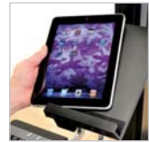
Tablet/Document Holder for WorkFit-S 97-558-200 (black) Includes lift handle