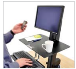
Worksurface for WorkFit-S 97-581-019 (black)