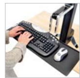
Large Keyboard Tray for WorkFit-S 97-653 (black)