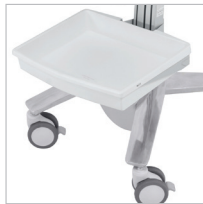
SV FRONT TRAY