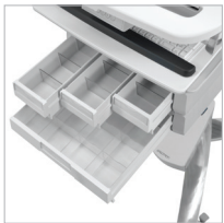
SEVERAL DRAWER CONFIGURATIONS