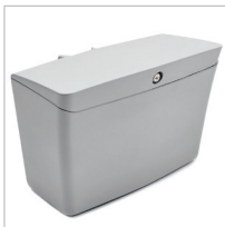
SV STORAGE BIN