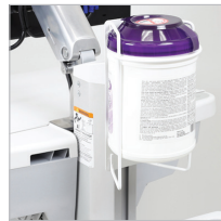
SV SANI-WIPES HOLDER