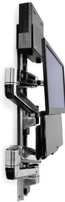
LX Sit-Stand Wall Mount System shown with Medium CPU Holder

LX Sit-Stand Wall Mount System: Keyboard folds to within 6.8" (17,3 cm) of wall in storage position; LCD arm folds back to a depth of 5.5" (14 cm)