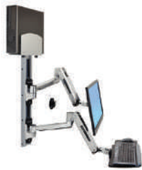
LX Sit-Stand Wall Mount System