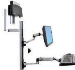
LX Wall Mount System