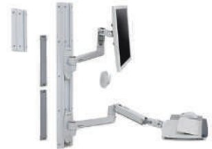
LX Wall Mount System, White