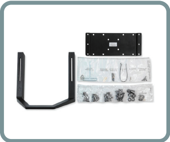
HANDLE KIT ENHANCE EASE OF MOTION #97-760-009