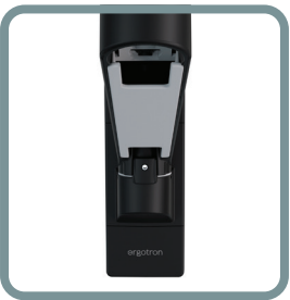
SAVE ROTATION STOP: PREVENT DAMAGE TO WALLS, PARTITIONS, OR CUBICLES