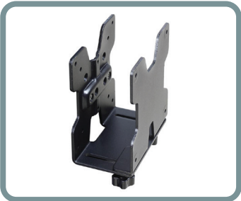
MINI PC MOUNT EASY METHOD FOR INTEGRATING A MINI PC INTO YOUR WORKSPACE #98-721