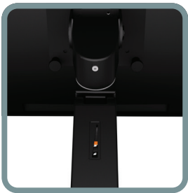
SMART TENSION INDICATOR: SET TENSION LEVEL ONCE AND REPEAT FOR QUICK INSTALL OF MULTIPLE WORKSTATIONS