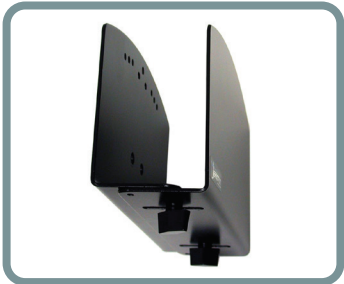
MEDIUM & SMALL CPU HOLDERS PROVIDES A CONVENIENT METHOD FOR STORING #98-723 #98-722