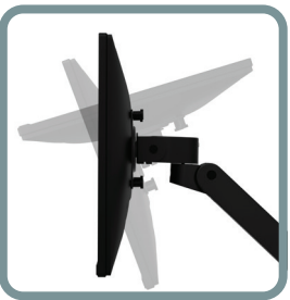
EXTENSIVE TILT RANGE: BETTER ERGONOMICS FOR USERS