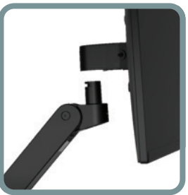
DETACHABLE HEAD MAKES SET-UP AND MONITOR SWAPS A BREEZE