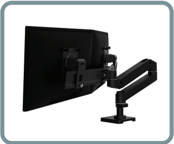
DISPLAY BOW SINGLE TO DUAL DIRECT #98-737