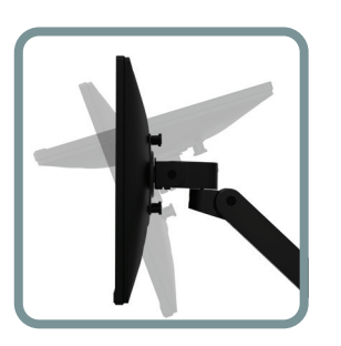
EXTENSIVE TILT RANGE: BETTER ERGONOMICS FOR USERS