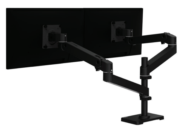
ADD UP TO THREE ARMS WITH DISPLAY ARM EXPANSION KIT (ONLY FOR TALL POLE) #98-734