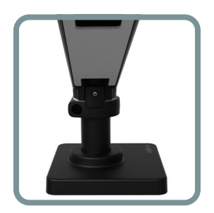
SAVE ROTATION STOP: PREVENT DAMAGE TO WALLS, PARTITIONS, OR CUBICLES