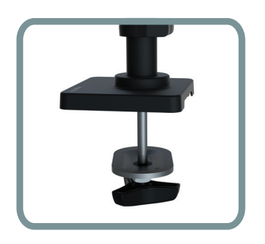
GROMMET MOUNT #98-728