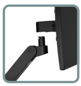
DETACHABLE HEAD MAKES SET-UP AND MONITOR SWAPS A BREEZE