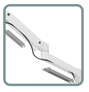
CONVENIENT CABLE COVER: FASTER INSTALLATION AND SLEEKER LOOK