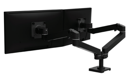
SINGLE TO DUAL SIDE BY SIDE CONVERSION KIT #98-745