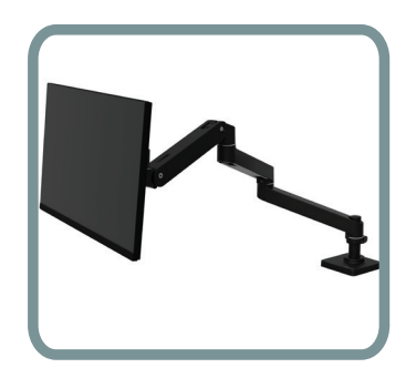
MONITOR ARM EXTENSION #98-731