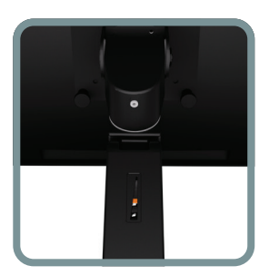
SMART TENSION INDICATOR: SET TENSION LEVEL ONCE AND REPEAT FOR QUICK INSTALL OF MULTIPLE WORKSTATIONS