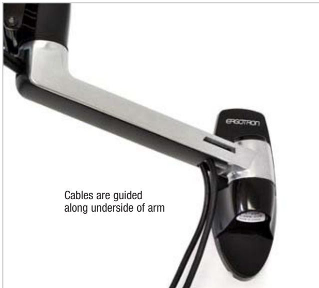
Cables are guided along underside of arm

Patented CF pivot motion technology produces smooth tilt adjustment Screen's viewing angle is easily adjusted for each user