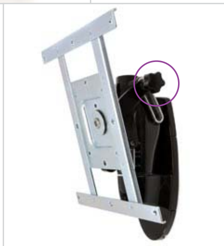
Tilt lock-down feature also provides tilt tension for odd-sized displays that have an extremely forward center of gravity