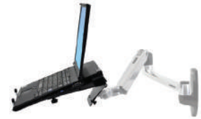
Attach a laptop to an LX Desk or Wall Mount Arm with Notebook Tray accessory #50-193-200