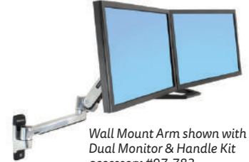
Wall Mount Arm shown with Dual Monitor & Handle Kit accessory #97-783

Attaches directly to sturdy vertical surfaces. Where applicable, install to wood stud. (Fasteners for direct attachment to wood studs or concrete surfaces are included.)