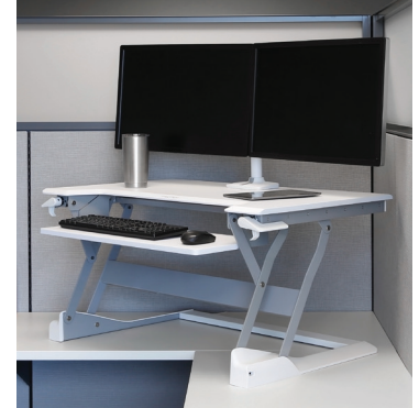
SHOWN WITH WORKFIT-TL SIT-STAND WORKSTATION

THE LOW-PROFILE MONITOR CROSS-BAR PROVIDES A COMPACT RANGE OF MOTION