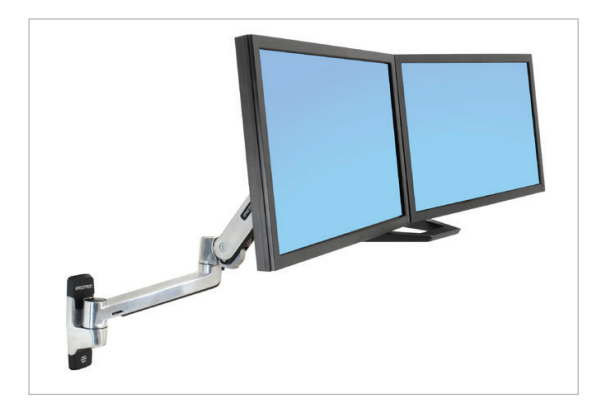
Dual Monitor & Handle Kit (#97-983) is the perfect dual-mounting solution for monitors 17" to 24"; the handle makes it easy to reposition screens