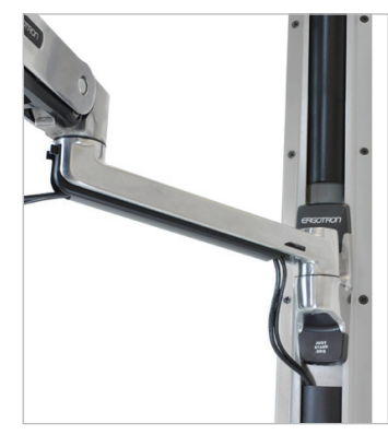
Recommended: Attach Wall Mount Arm to an Ergotron Wall Track using bracket (#97-091)