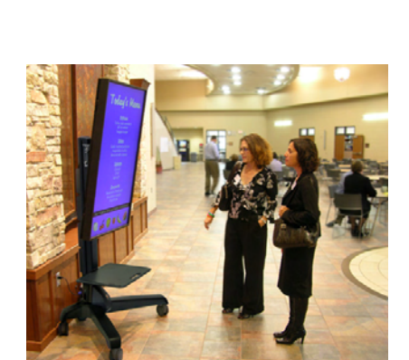
Neo-Flex Mobile MediaCenter: rotate your screen for portrait/landscape viewing.