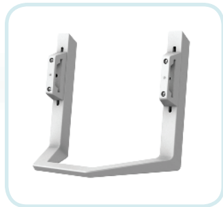
RECOMMENDED ACCESSORY: LX DUAL DIRECT HANDLE KIT 98-037-062