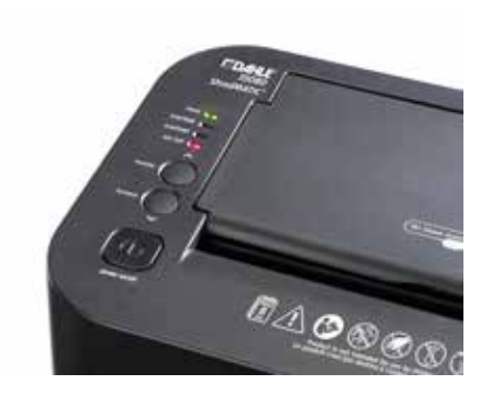
- easy-to-read control panel