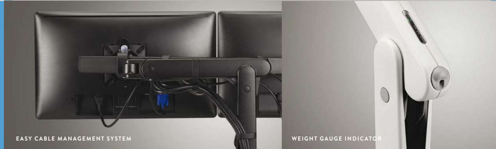
WEIGHT GAUGE INDICATOR