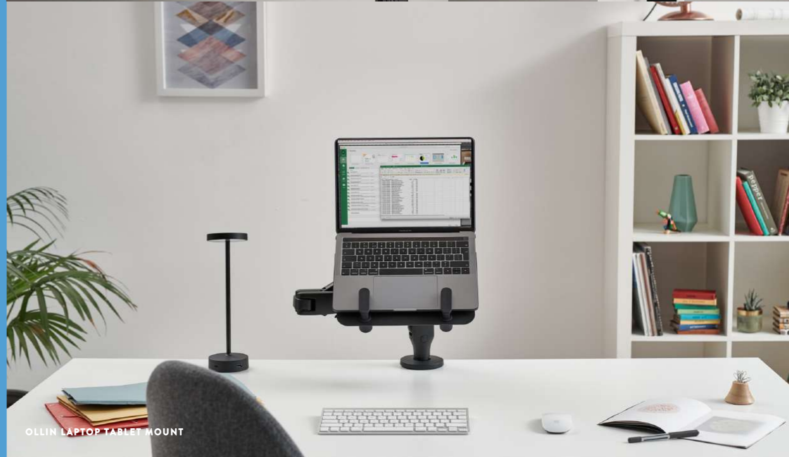
OLLIN LAPTOP TABLET MOUNT