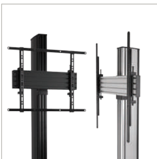
Maximum VESA fixing can be increased to 600mm using the included adaptor arms