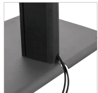
Integrated cable management for a neat and tidy installation