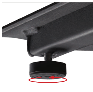
Supplied with adjustable levelling feet to accommodate uneven floor surfaces