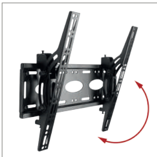
Unique 'Torsion-Tilt' mechanism allows for easy tilt adjustment up to +/-18°