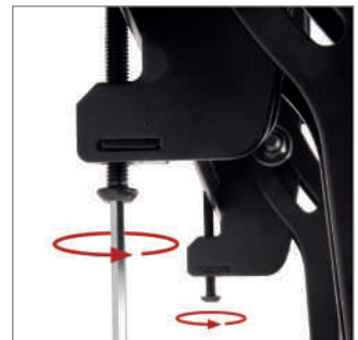
Security locking screws and Allen key provided for a secure installation