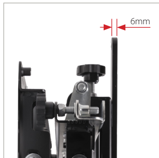
Adaptor arms are ultra-slim to keep the depth of the install to a minimum