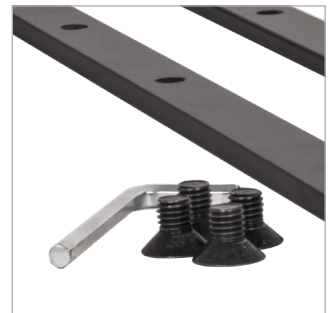
Easily fixes onto interface plates / arms using the screws provided