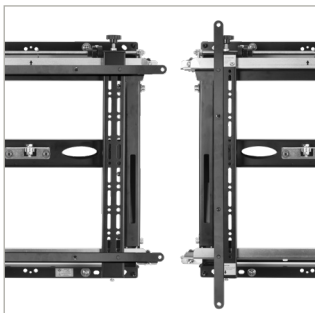
Can be used to accommodate both landscape and portrait installations