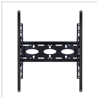
Can be used with a large variety of existing B-Tech products such as the BT8431, BT8441 and System X™ Interface Arms