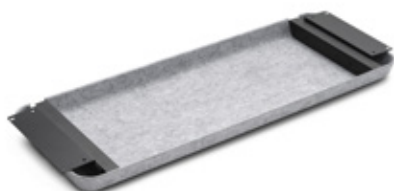
6000-0192-0038 Light Grey