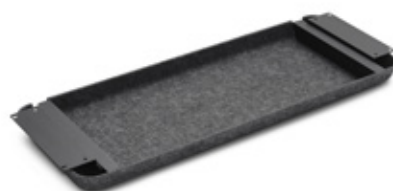
6000-0192-9000 Dark Grey